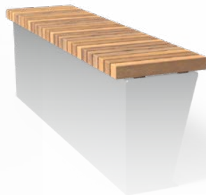
SEATING IN WIDTH